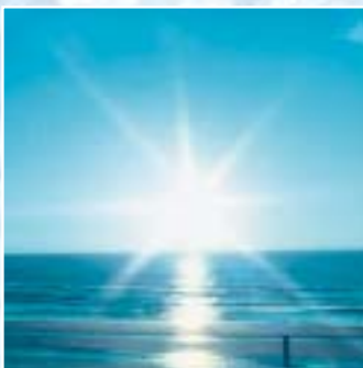
UV is a Component of Sunlight

WEDECO customer service staff are just a phone call or email away for all of your parts or equipment needs. They can answer any technical questions regarding a product feature, service, or installation. In most cases, WEDECO is able to ship equipment and parts the same day you place an order, and will deliver the items on a rush basis if needed.