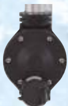
Accessory Option: Normally Closed Solenoid Valve