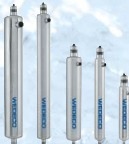
40 GPM 30 GPM 18 GPM 10 GPM 4 GPM